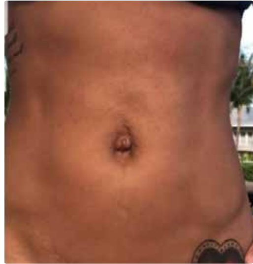
60 days after 1 single session