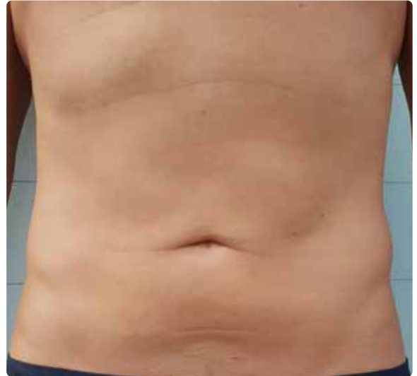
30 days after the 3 rd treatment

Patient with skin laxity problems in the abdominal area close to the navel, despite his intense sports activity and good muscular tone.