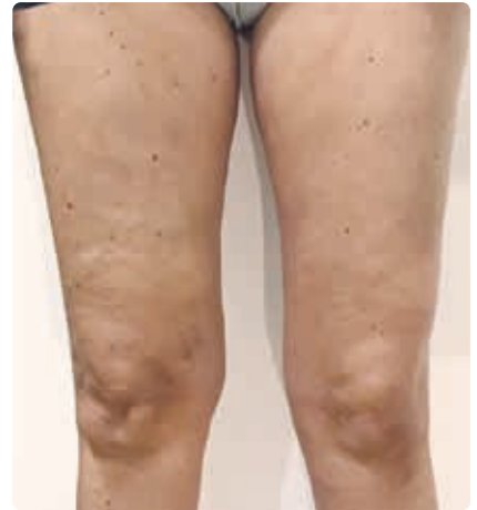
Follow-up after the 2 nd session.