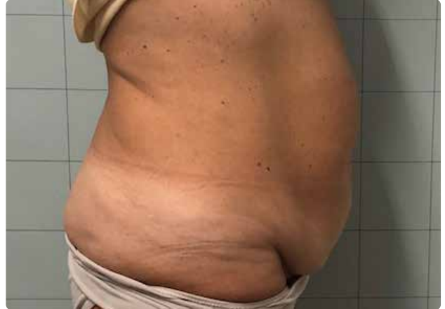
30 days after the 3 rd treatment