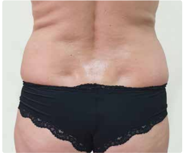
30 days after the 2 nd session