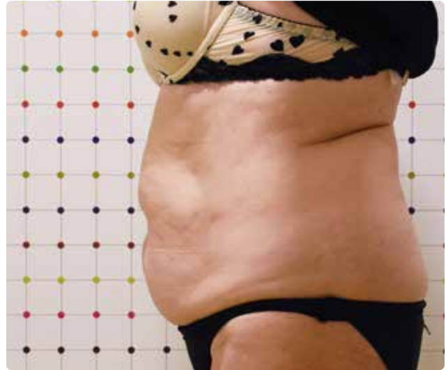
30 days after the 2 nd session

Waist reduction: 10 cm for the high abdomen and 5 cm for the lower abdomen