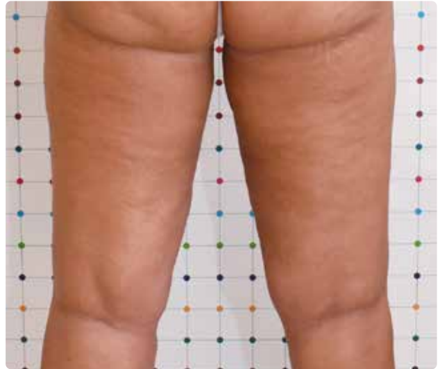
Follow-up after the 3 rd session