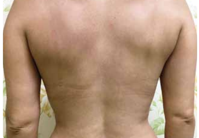
90 days after 1 single session