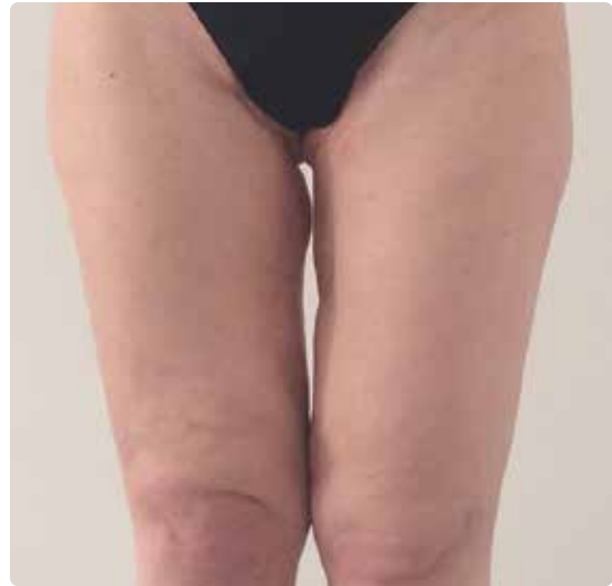
Follow-up after the 3 rd session