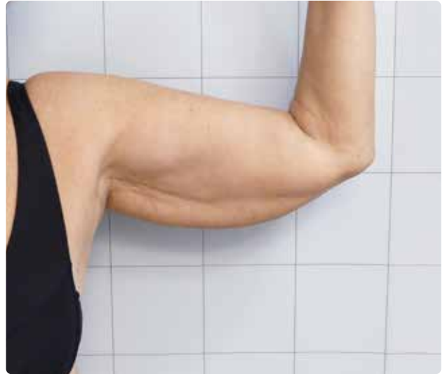
Follow-up after the 3 rd session