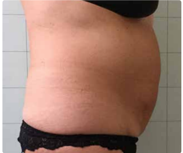
30 days after the 3 rd treatment