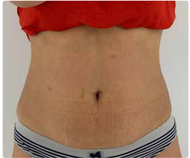
15 days after 1 single session