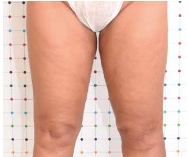
Follow-up after the 3 rd session