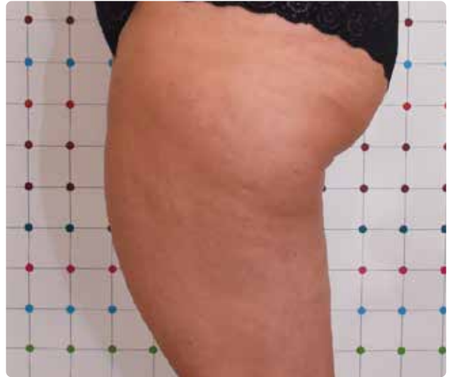
Follow-up after the 4 th session