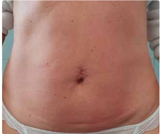
30 days after the 4 th treatment