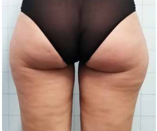
30 days after the 4 th treatment