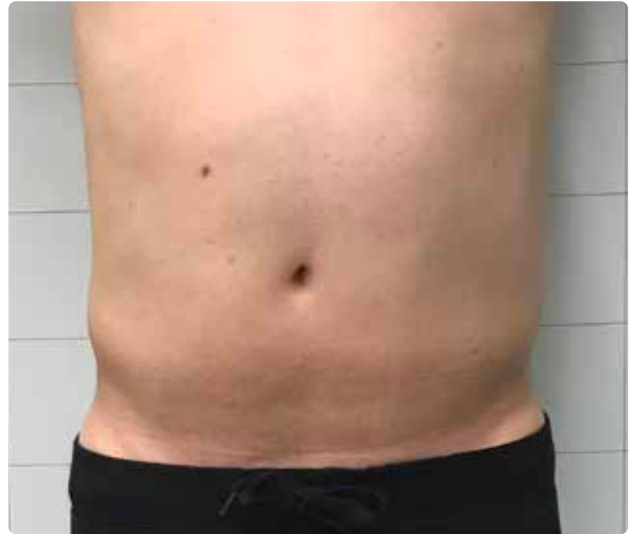
35 days after the 2 nd session