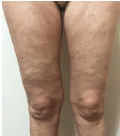
Follow-up after the 1 st session.