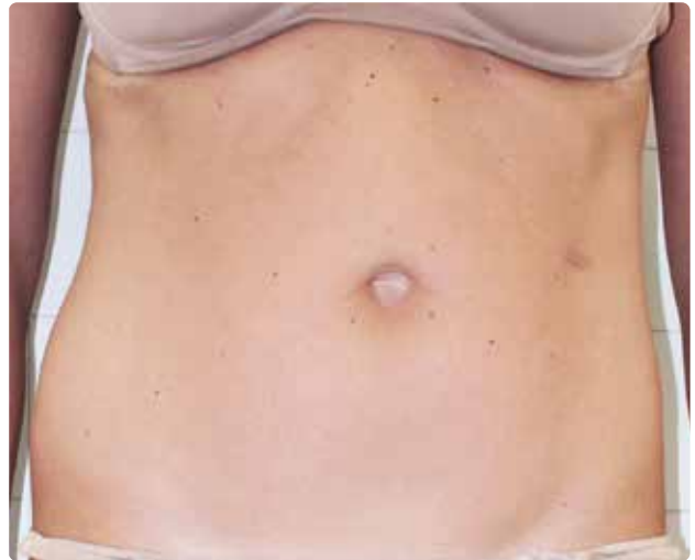
35 days after the 2 nd session