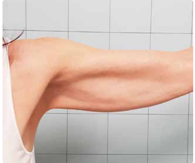
30 days after the 3 rd treatment