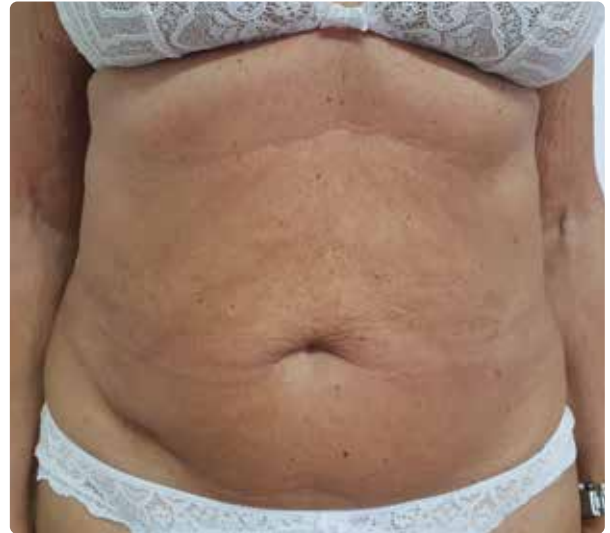
60 days after 1 single session