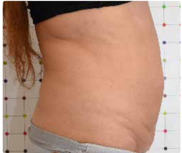
45 days after 1 single session