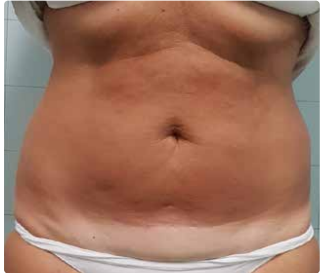
45 days after 1 single session

Courtesy of Benedetta Salsi M.D., Reggio Emilia - Italy