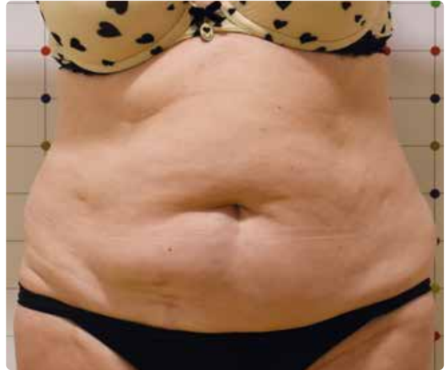
30 days after the 2 nd session

Waist reduction: 10 cm for the high abdomen and 5 cm for the lower abdomen