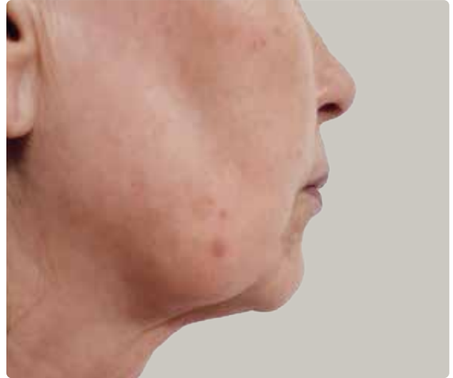
After 4 sessions