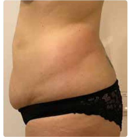
Follow-up after the 3 rd session