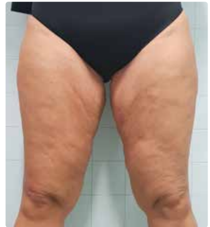
60 days after 1 single session