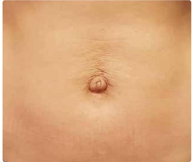
30 days after the 3 rd treatment