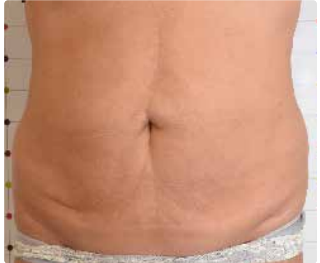
45 days after 1 single session