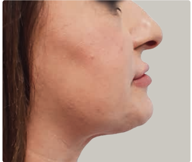
After 4 sessions