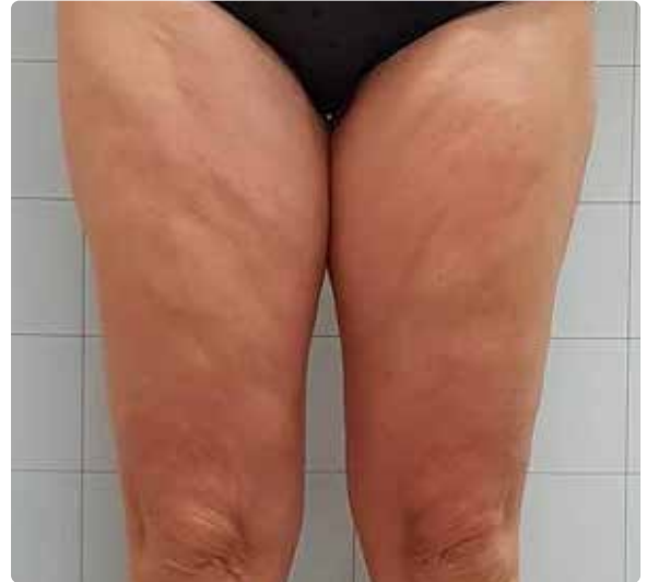
60 days after the 2 nd treatment